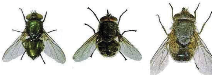
Australian Sheep Blowfly Western Australian Brown Blowfly Lesser Brown Blowfly

For more information, go to http://bit.ly/1Q1TC7m to view the WA Department of Agriculture and Food's excellent webpage on fly strike.