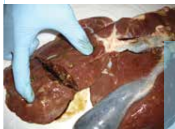
An example of chronic liver fluke found during routine NSHMP surveillance

For more information about the NSHMP, go to http://bit.ly/1Oz06cp .