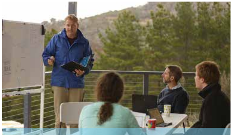
The latest Farm Biosecurity videos look at training, biosecurity planning, monitoring and recording and managing feral animals and weeds

Earlier videos in the series covered the biosecurity risks associated with people, vehicles and equipment and moving anything onto or off your property. To view all the videos in the series go to farmbiosecurity.com.au/videos .