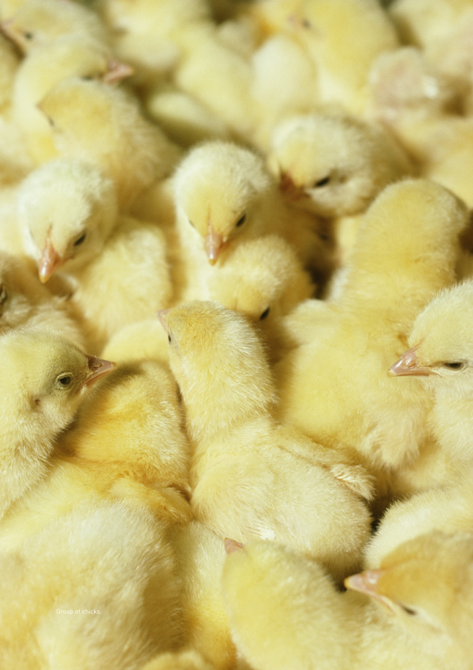
Group of chicks.