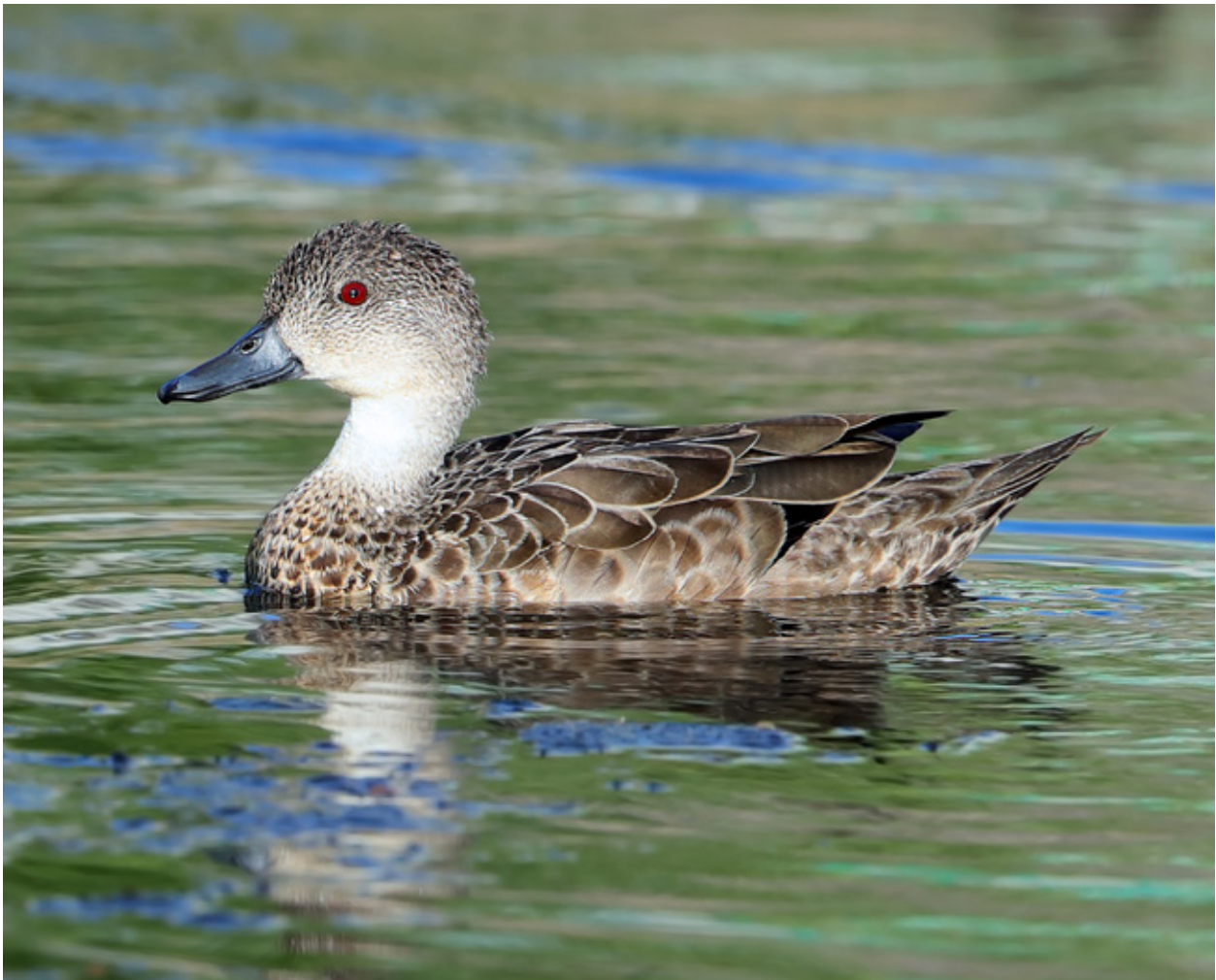
Wild waterfowl can be reservoirs of avirulent Newcastle disease viruses.

Some phylogenetic studies provide evidence for migratory bird movement as a possible mechanism for intercontinental virus spread of AOA-1 (Liu et al 2020, Hicks et al 2019).