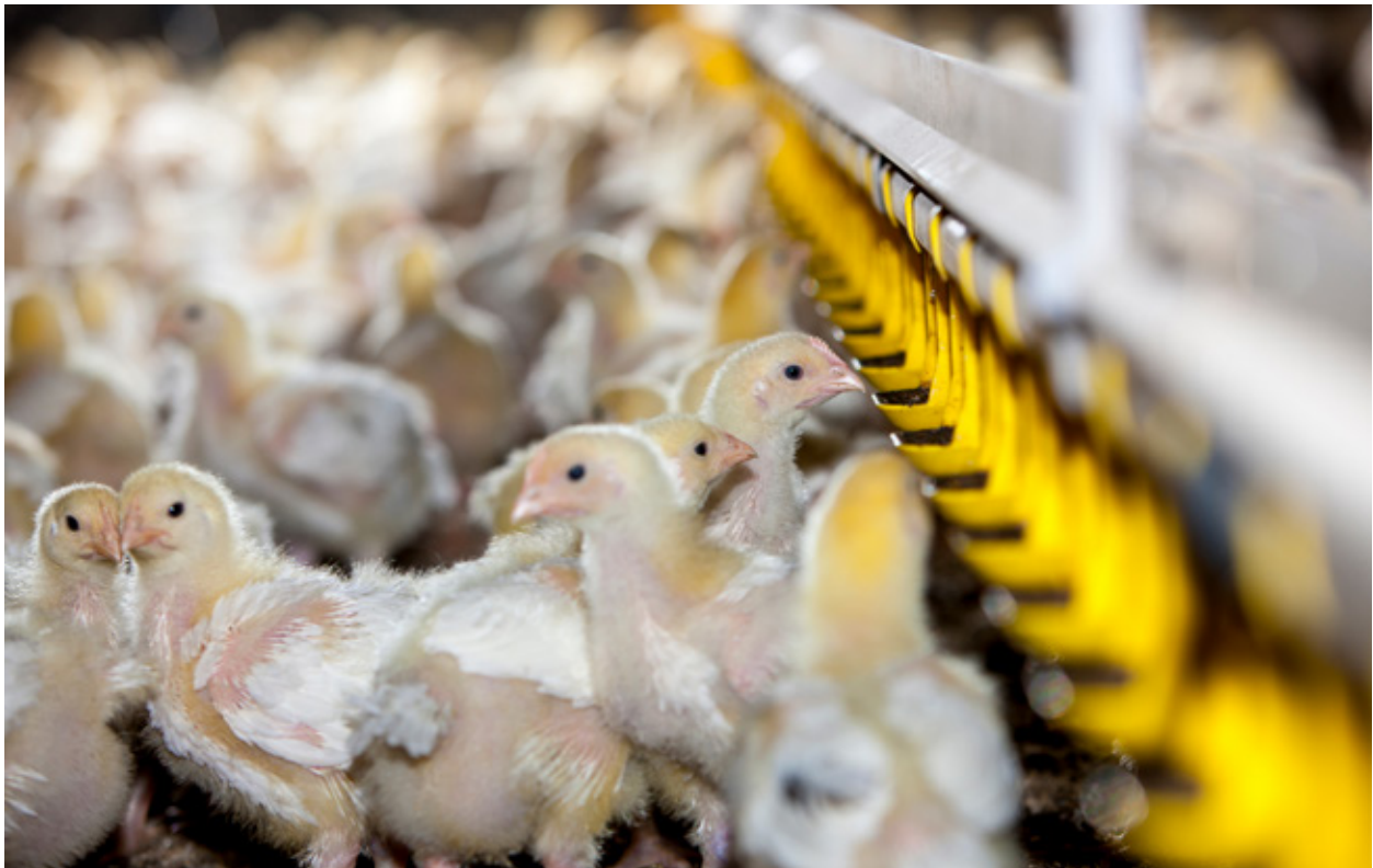
Newcastle disease vaccines are available and being used in Australia.

Short-lived birds (broilers) were included in the vaccination regime for previous iterations of the NDMP. Vaccination of these birds is now based on the risk status of the jurisdiction and protocols outlined in the NDMP to be followed for different risk statuses. Victoria and New South Wales require broiler vaccination; Queensland and South Australia allow opt-out vaccination for broilers if a surveillance protocol is implemented; and Western Australia and Tasmania do not require vaccination of broilers.