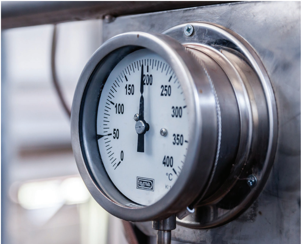
Incinerator temperature gauge.

Recommended inactivation procedures (although they do not guarantee absolute inactivation and may not be suitable for all substrates) include: