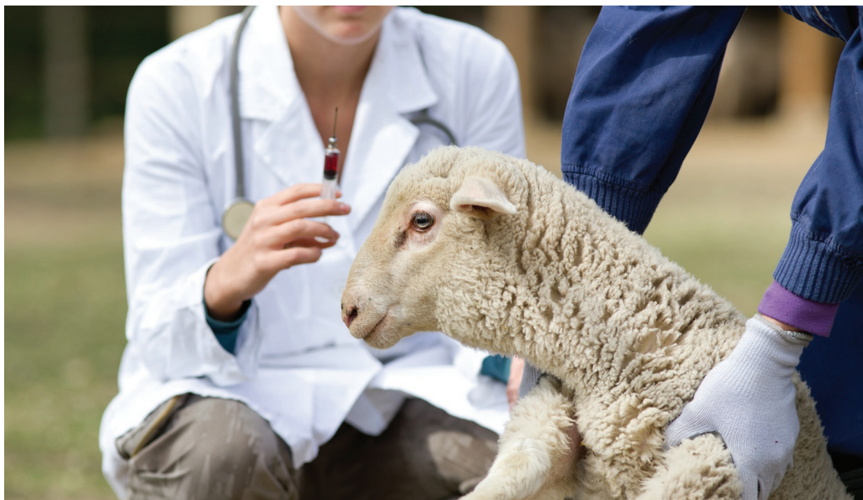
Lamb waiting vaccination.

Spread of the agent by inoculation of a contaminated veterinary product is expected to be much more efficient than natural (oral) transmission and is therefore expected to affect many more animals in the flock or herd at the one time (Bertolini et al 2012).