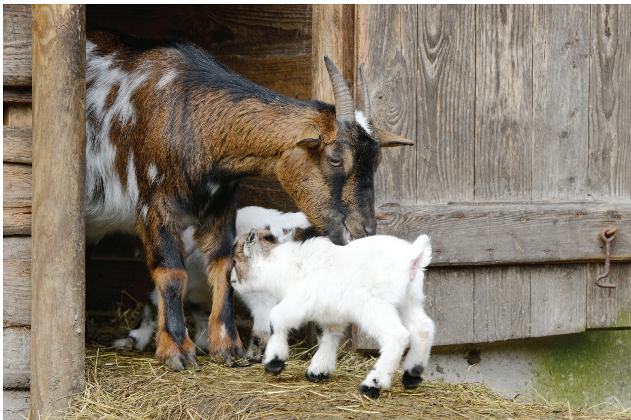
Goat kid and mother outside birthing shed.