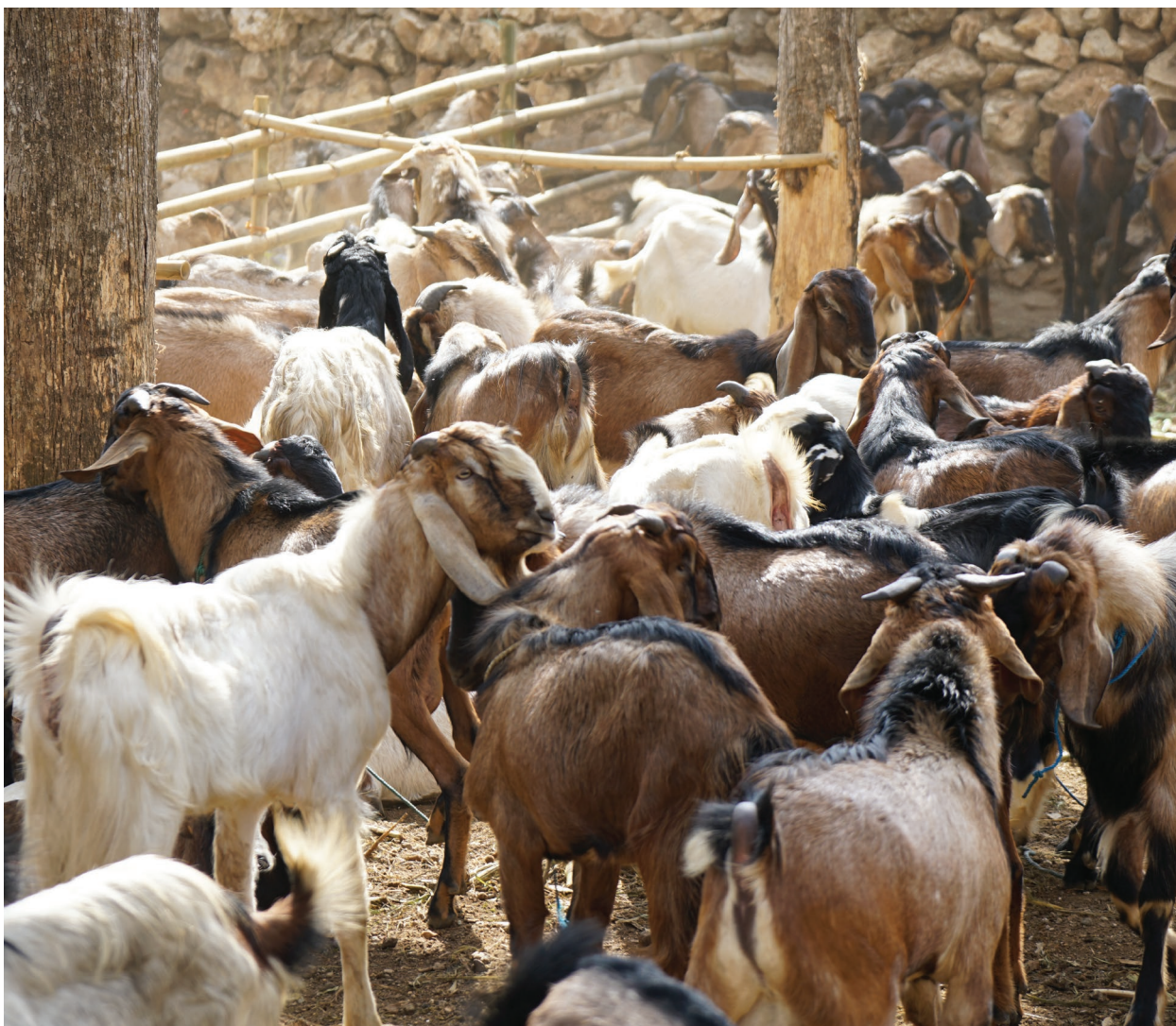
Goats herded in outdoor pen.

products or contaminated feed are implicated in the outbreak, animals treated with or fed the same 'batch' are also equivalent risk. Equivalent-risk animals have the highest likelihood of infection of all animals not showing clinical signs, and require euthanasia and testing. Premises containing equivalent-risk animals should be classified as dangerous contact premises.