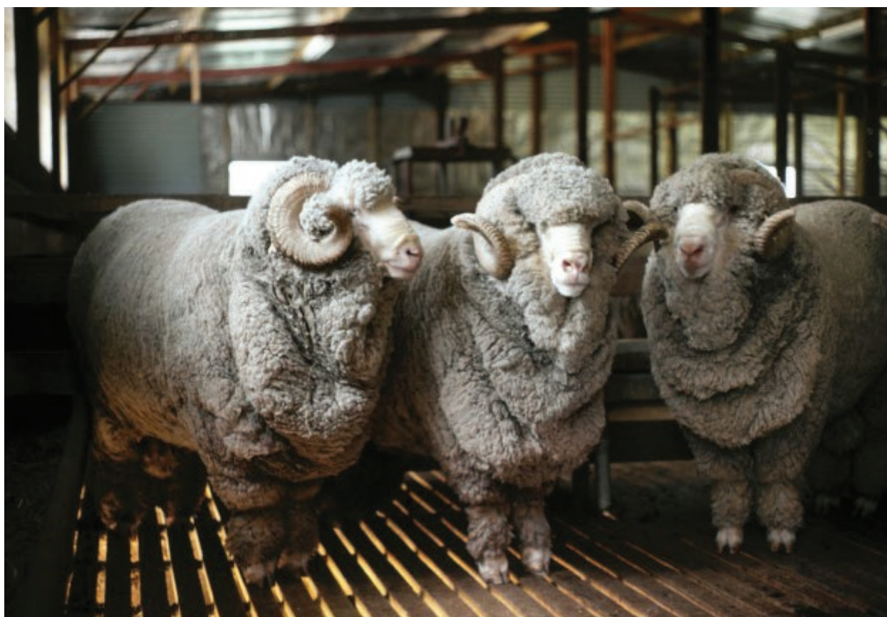
Merino rams in shed.

In goats, polymorphisms in the gene encoding the PrP protein that are associated with resistance to scrapie are under study, but there is no international consensus on what constitutes a resistant genotype. Curcio et al (2016) summarised a number of studies that have explored potential polymorphisms in the PrP gene in goats.