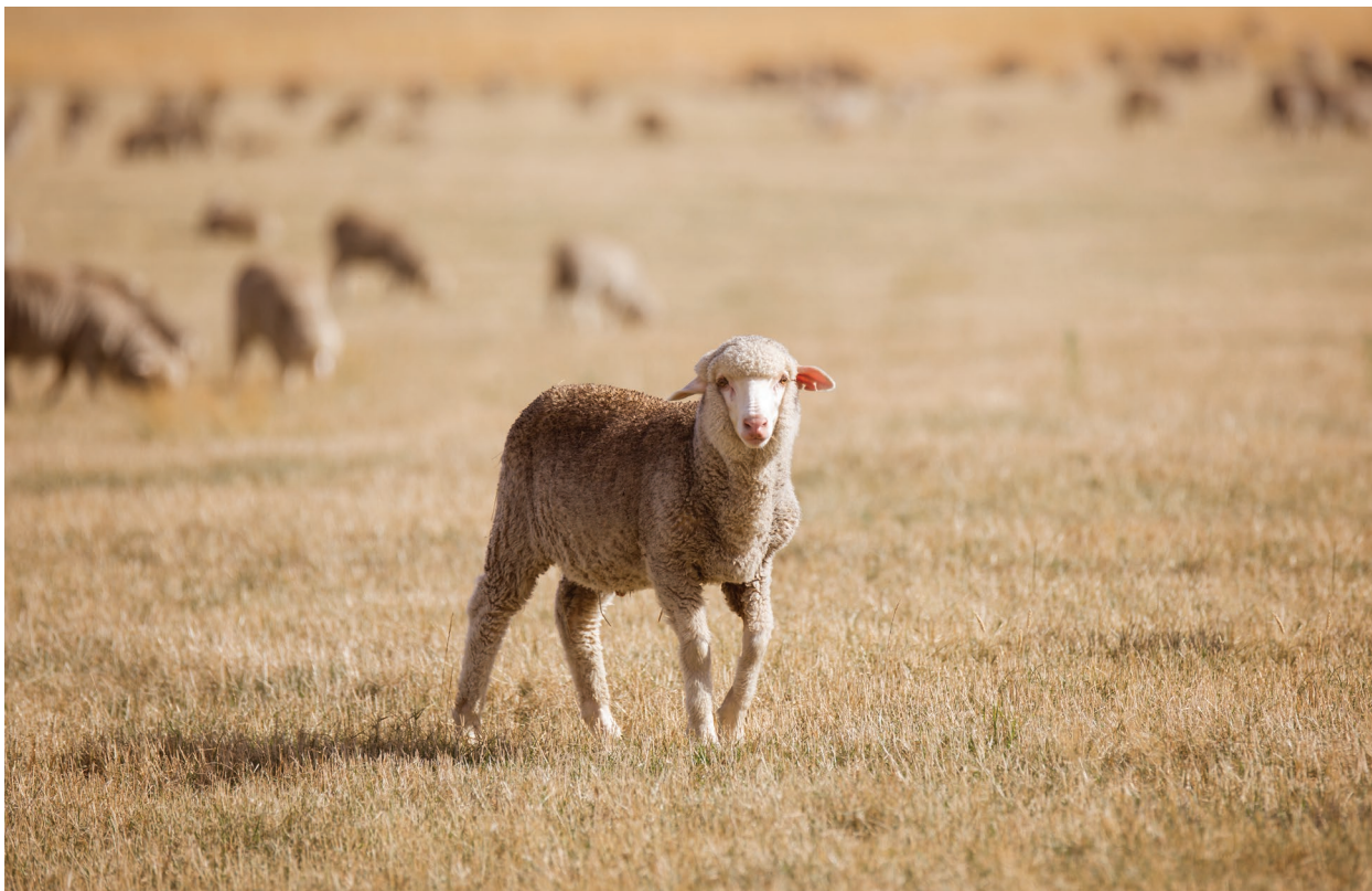
Sheep in dry paddock on extensive property.

short term. However, the welfare of animals on premises affected by disease control measures should be monitored, and any issues that arise should be addressed.