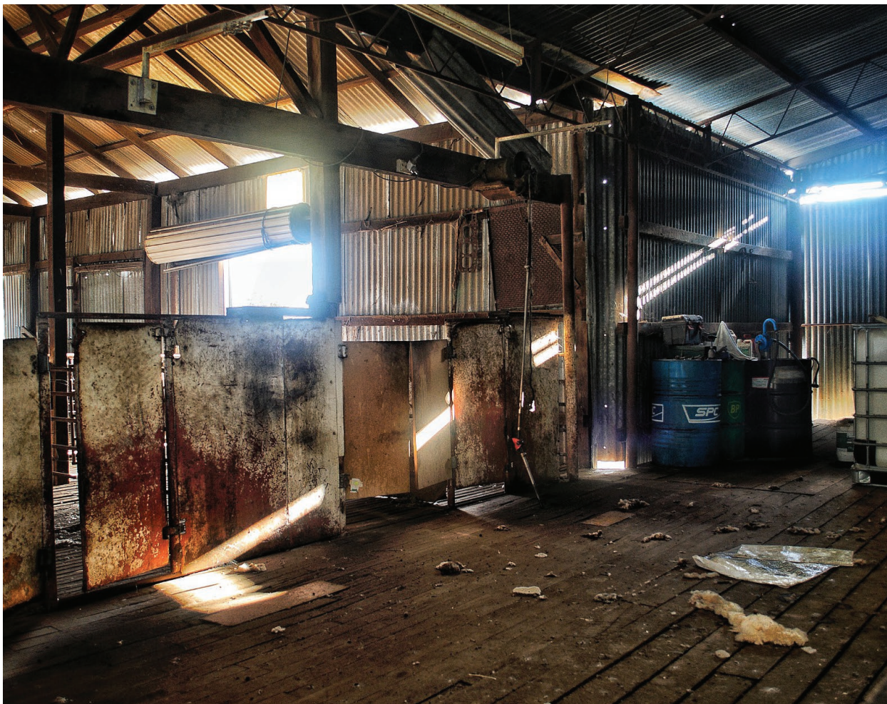
Empty shearing shed.

To avoid having premises that pose different risks remaining as TPs for a long time, an initial assessment of a TP should reclassify it as a DCP or LCP.