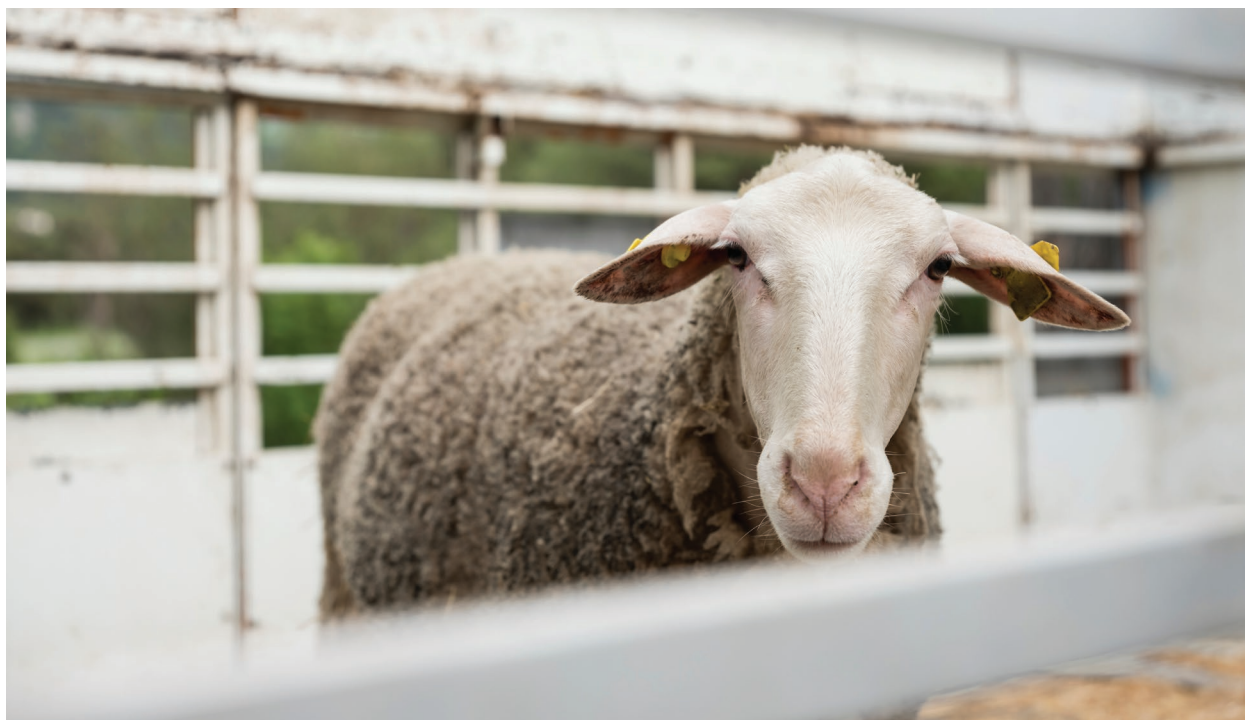
Sheep loaded onto truck.