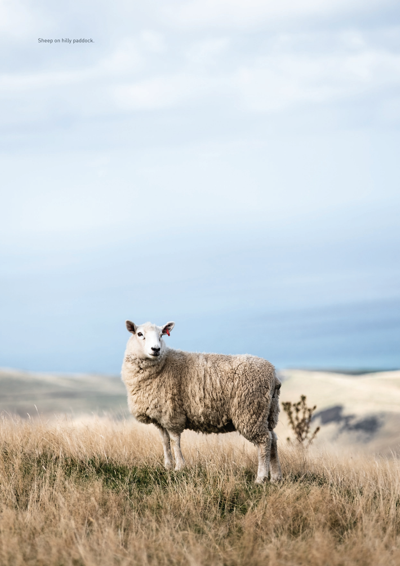
Sheep on hilly paddock.