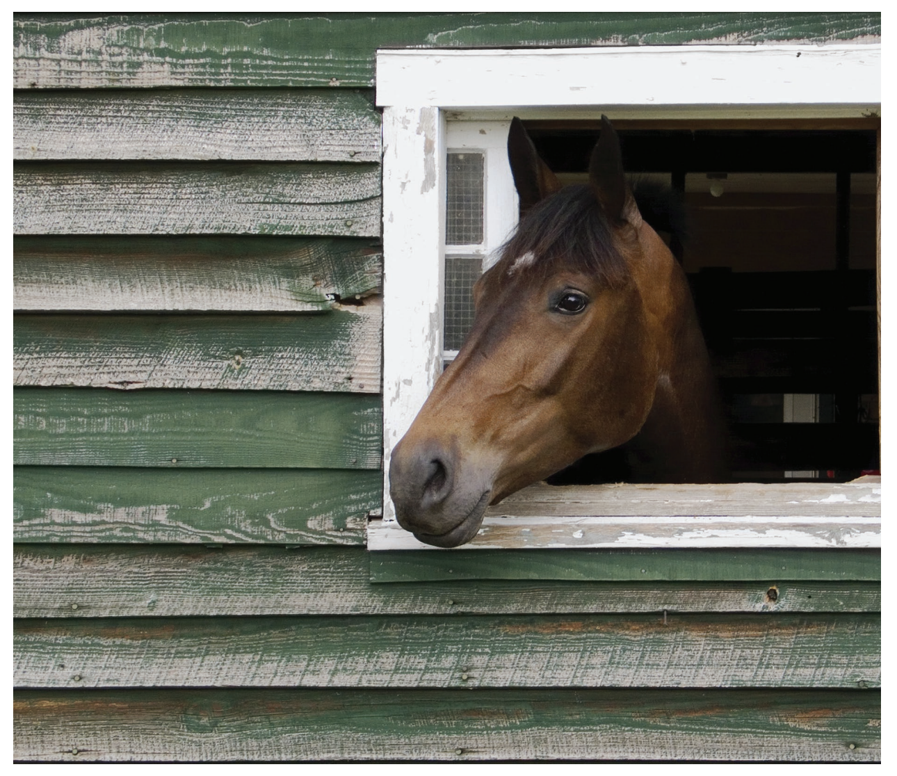
Horse housed in barn.

eradication is no longer considered feasible or practicable, or when the NMG formally declares the outbreak over.