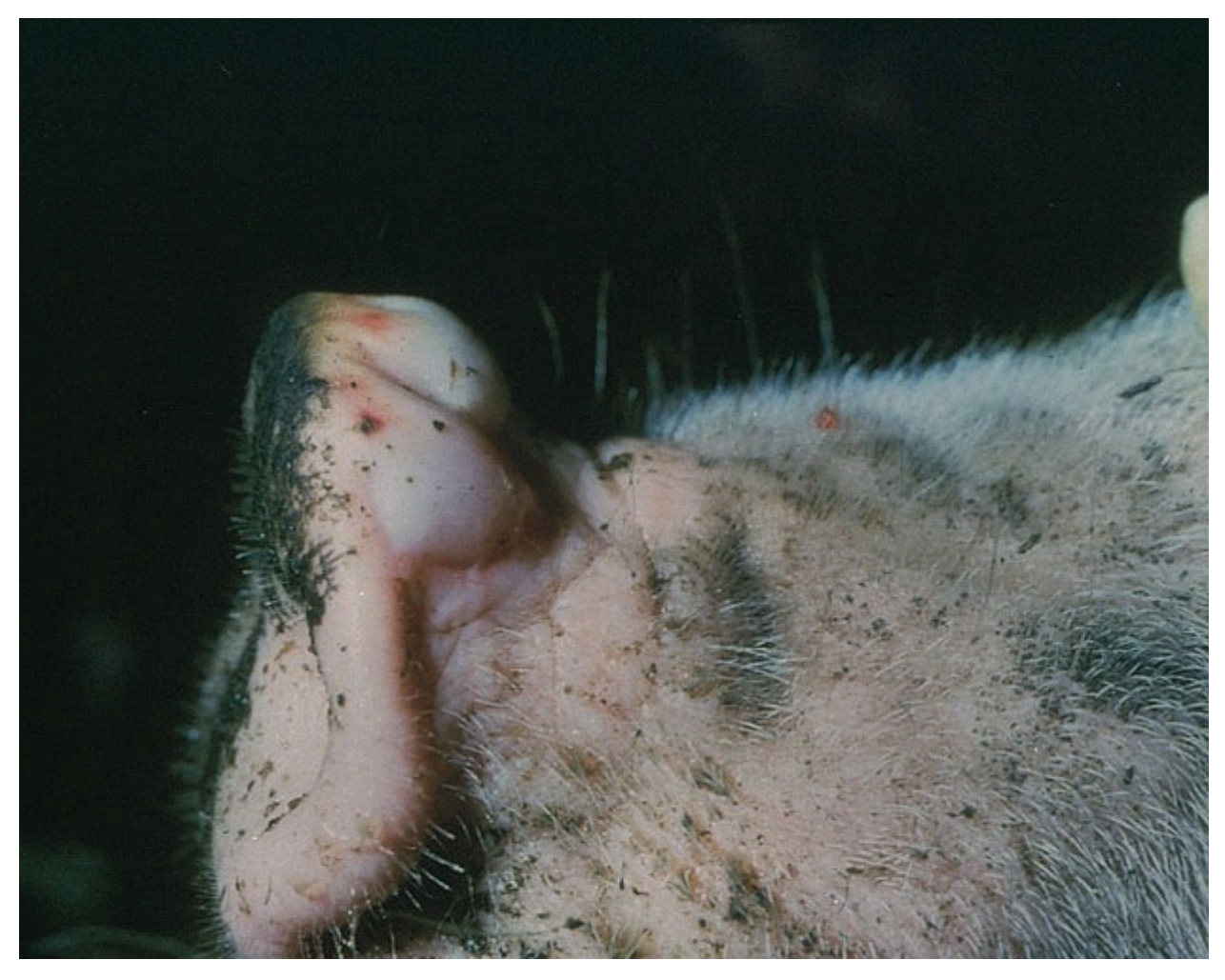
Pig skin with large vesicle (bulla) on dorsal snout.

If eradication cannot be achieved, the policy will be modified to contain the disease and to minimise the effects on trade.