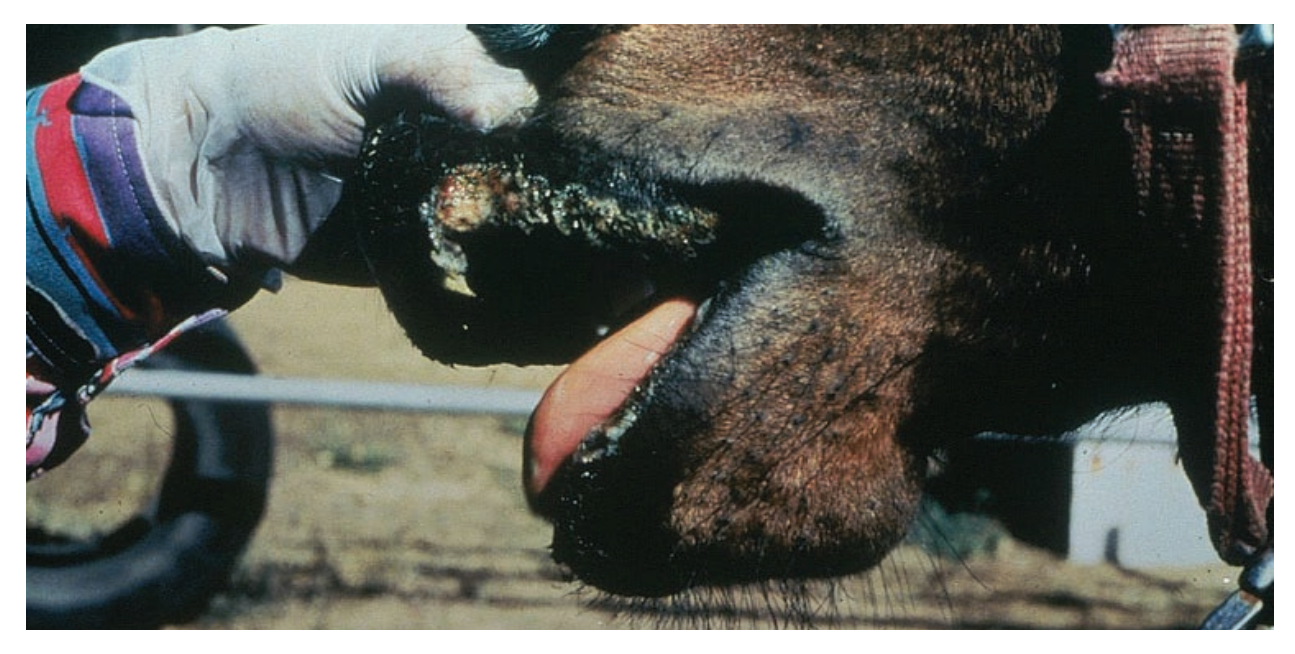
Horse mouth with extensive erosion of the lip at the mucocutaneous junction.

disease progresses, difficulty in eating, lip smacking, lameness (especially in pigs), mastitis and drops in production (loss of condition, reduced or ceased lactation) may be observed.