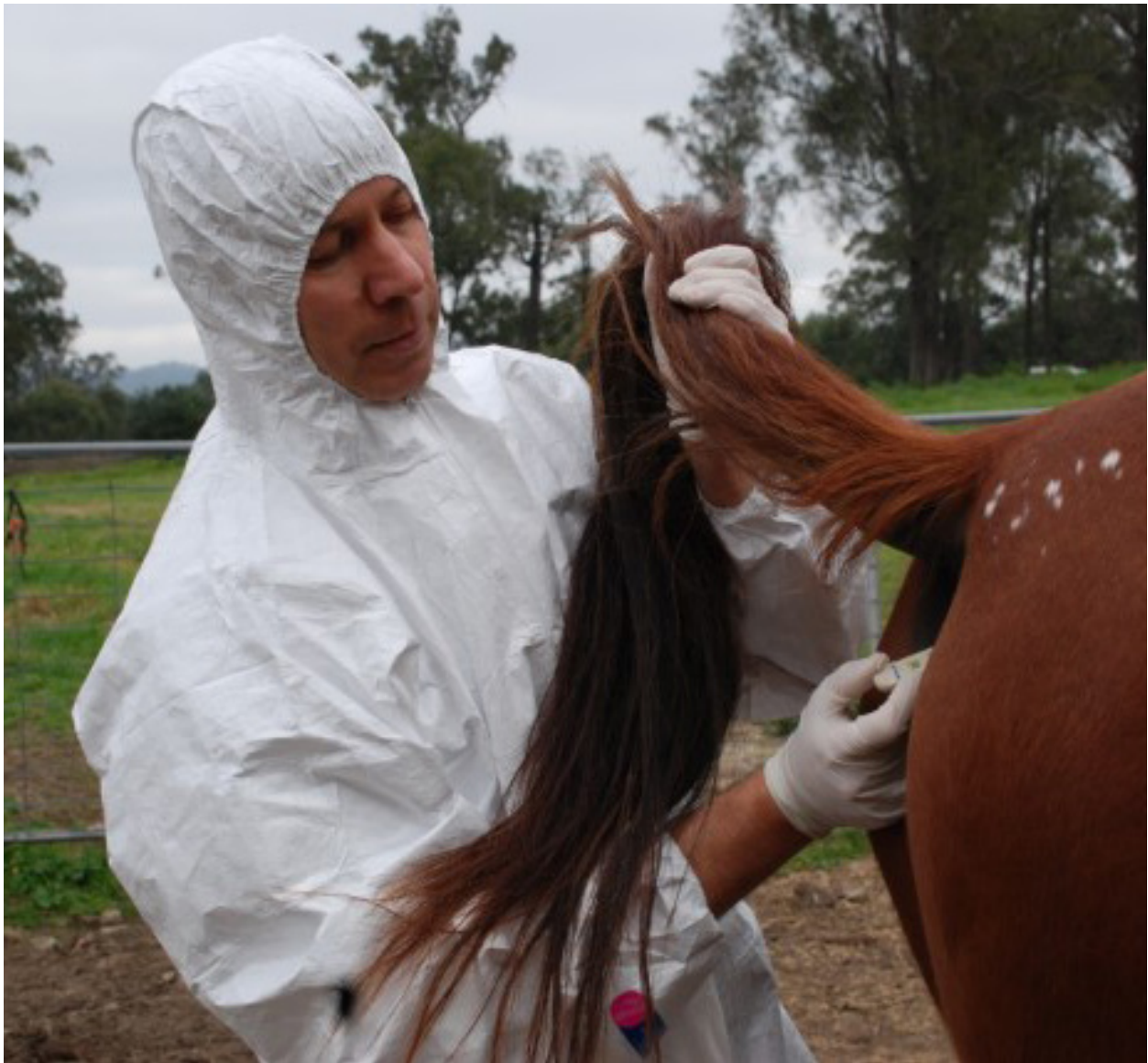
Clinical signs of AHS may include fever.