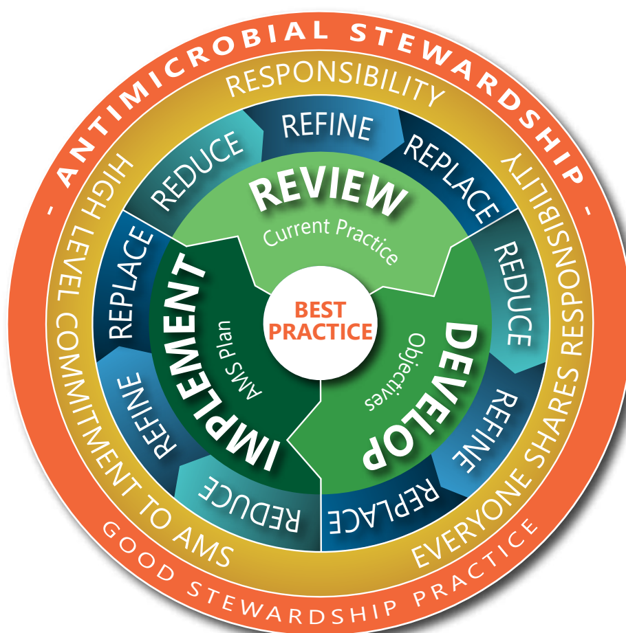
Figure 1. The 5R framework for good antimicrobial stewardship.

Compared to most other countries, Australia has an enviable reputation for low use of antimicrobial agents and low frequency of AMR. However, there are only ad hoc systems in place to capture this information, although there are efforts through the National AMR Strategy to dramatically improve availability of data (Australian Government, 2015).