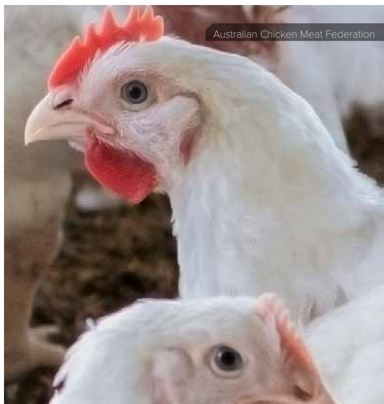
Australian Chicken Meat Federation

Before the development and publication of Australia’s first National AMR Strategy, various sections of the Australian animal health community, particularly those devoted to livestock, had been refining production systems to minimise disease challenge to animals. This was achieved through a collaborative relationship between farmers and veterinarians, and their efforts encompassed many of the elements of what is now described as antimicrobial stewardship (AMS). The AMS elements have always been at the core of operations for livestock industries and their supporting veterinarians, due at least in part to the economic benefits of growing livestock that are free from disease. In many cases, the cost of treating or preventing disease with antimicrobials, and the resulting loss in productivity of a sick animal, outweighs the cost of improving biosecurity, hygiene practises and overall husbandry, which are key principles of good AMS. Therefore, no specific date can be ascribed as the ‘start’ of AMS in any livestock industry, as in many industries these principles have long been included and formalised as requirements under various quality assurance (QA) and accreditation programs.