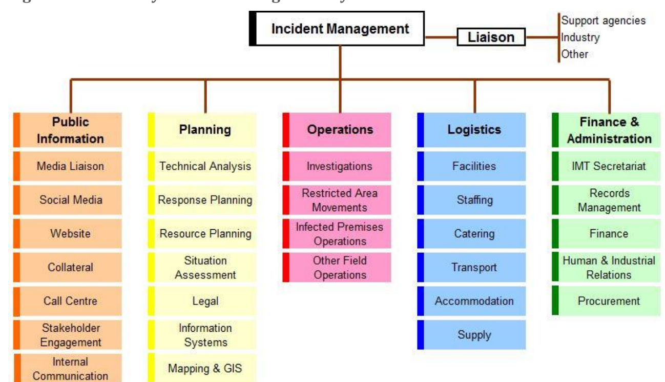
Figure 1 Biosecurity Incident Management System functions